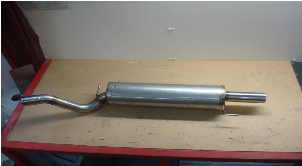
Fig 3 Rear Silencer. (material:- mild steel or stainless steel)